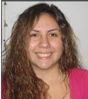
CRIMINAL JUSTICE Front Range Community College